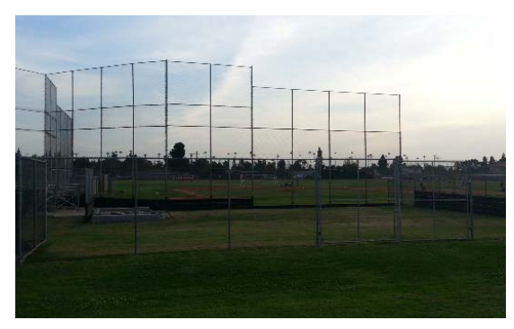
Add a second softball field.