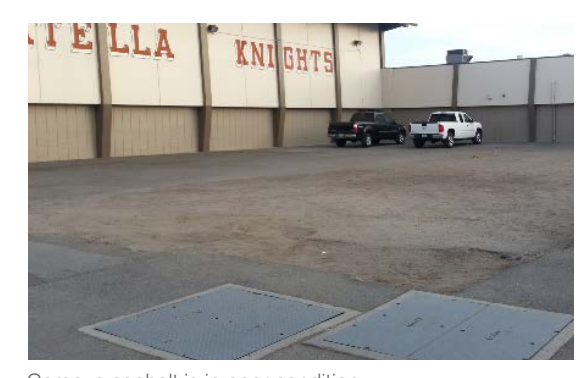
Campus asphalt is in poor condition.