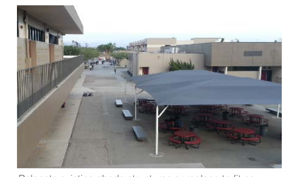
Relocate existing shade structures or replace to fit new quad design.