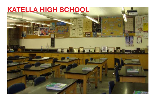
Additional science facilities needed.