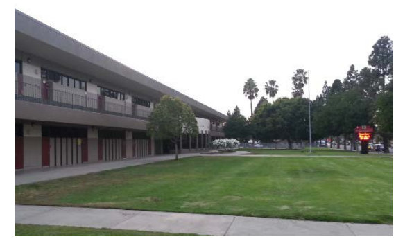
Need to accentuate the actual entrance of the school.