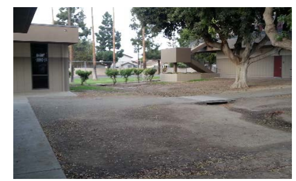
Redesign courtyards for outdoor learning spaces, improved drainage and landscape.

ANAHEIM UNION HIGH SCHOOL DISTRICT Facilities Master Plan