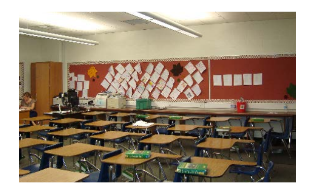
Upgrade classrooms and technology.